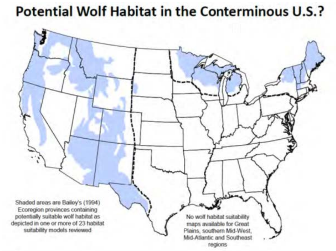
Figure 1. USGS & FWS map of potential habitat based on synthesis of existing spatial models. Produced by the FWS in 2013 in response to a FOIA request by Public Employees for Environmental Responsibility.

these areas, and thus reach true recovery, by trumpeting progress made toward recovery in the species' current range.